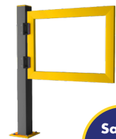
Safety Yellow & Grey